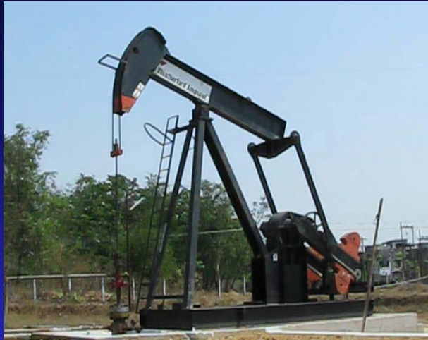
S R Pump at Moonidih